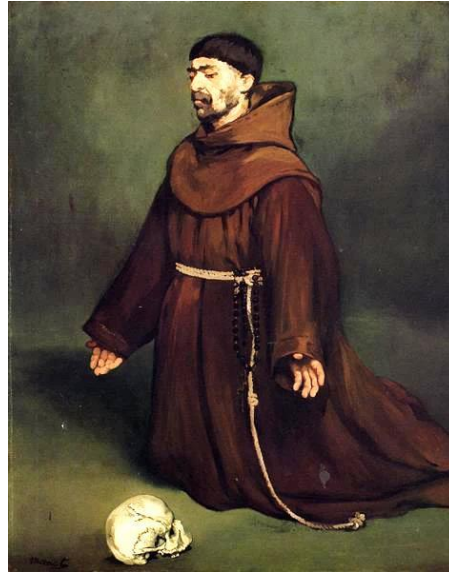
The monk at prayer, Edouard Manet